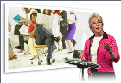
3-hr Online Program