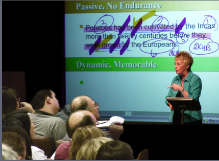
12-hr. Onsite Program